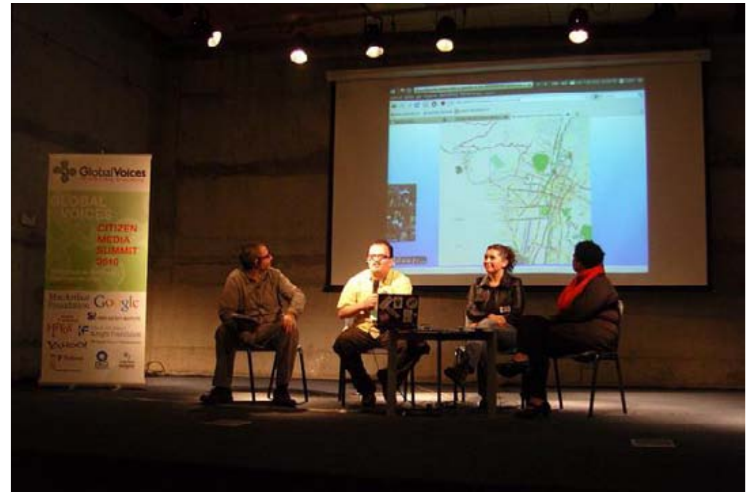
Librarians in action at GV Summit 2010